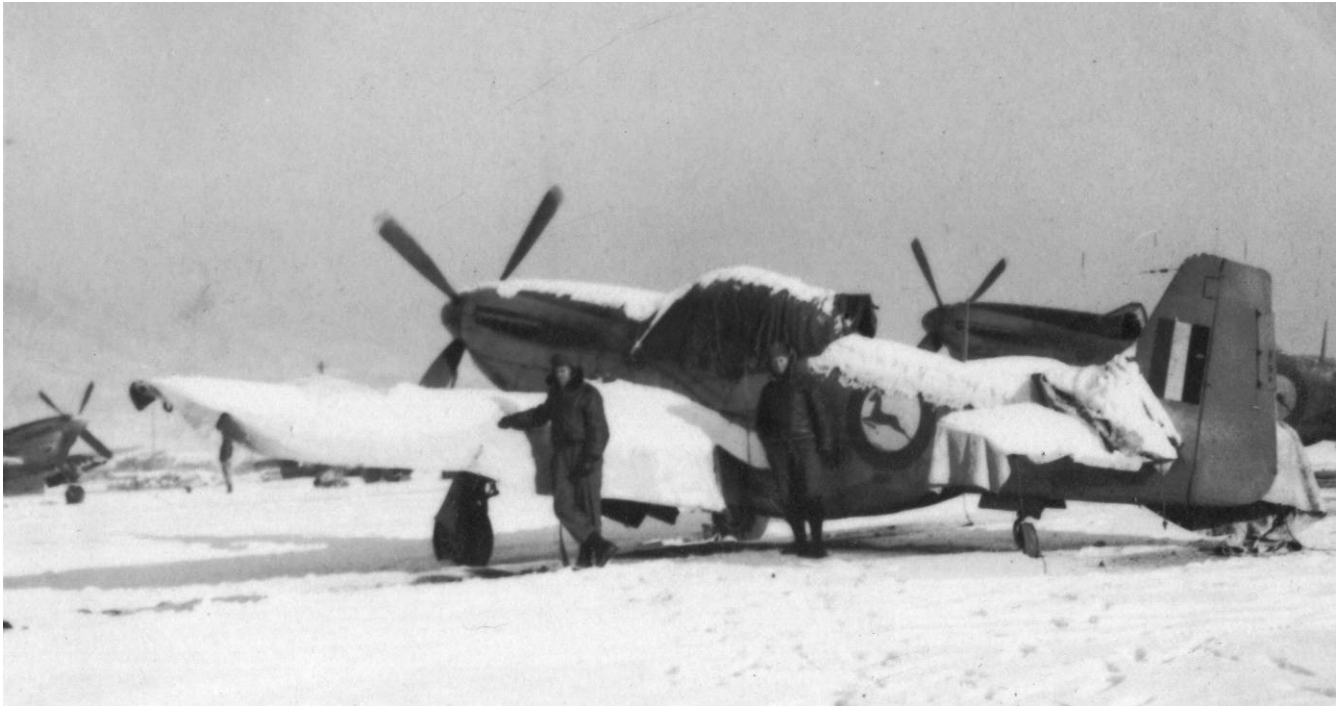
Sub-Zero conditions: A 2 Squadron Mustang covered with blankets to avoid the fuselage being iced-up

outstanding matters were attended to. During the day six missions comprising twenty-four sorties were flown, most of them close support in the battle area.