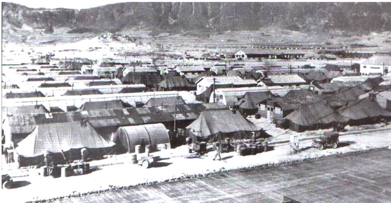
A view of the living quarters at -10, Chinhae Air Base. The living quarters consists of tents and huts

was hoped that if replacements could be speeded up, the problem of maintaining a high serviceability rate would be achieved.