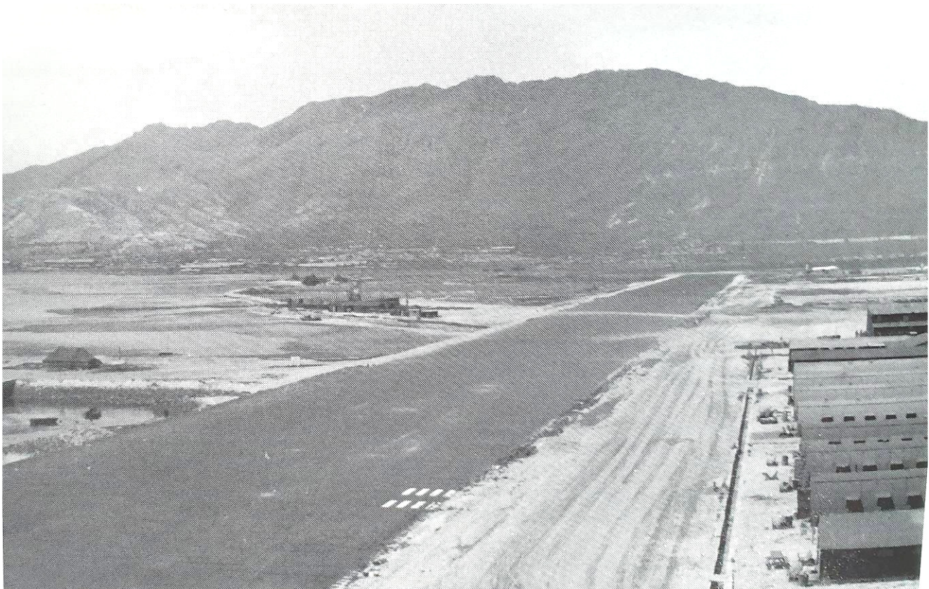
The runway at K-10. Note how close it is to the hangars. The South side of the airstrip was on the water. Approximately 50 feet separate the entire length of the runway from the bay